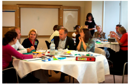
Social Enterprise Senior Leaders Programme October 2011

To find out more about taking part in the Liberate Social Enterprise Leadership Programme, please email: Leadership@socialenterprise.org.uk and we will send you an application form.