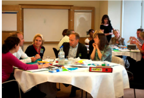
Social Enterprise Senior Leaders Programme October 2011

To find out more about taking part in the Youth Organisations Social Enterprise Leaders Programme, please email: Leadership@socialenterprise.org.uk and we will send you an application form.